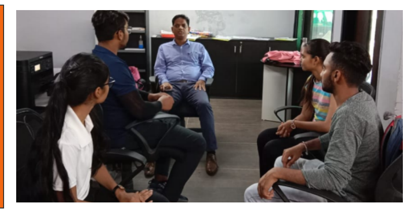
Student of Government PG College, Hisar visited at incubation centre on 8th August 2022 with few business ideas and were full of curiosity. We had a discussion on the journey of entrepreneurship and one to one interaction to make sure that we give required attention to each student and listen to their business ideas.